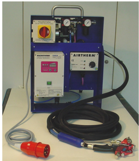
The hot spraying system: Airtherm together with heated material hose and double diaphragm pump.